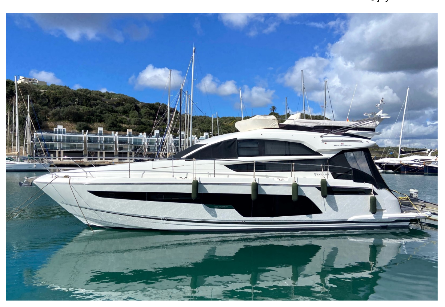
FAIRLINE SQUADRON 48

Tel: +44 (0)1305 766 504 sales@jdyachts.com