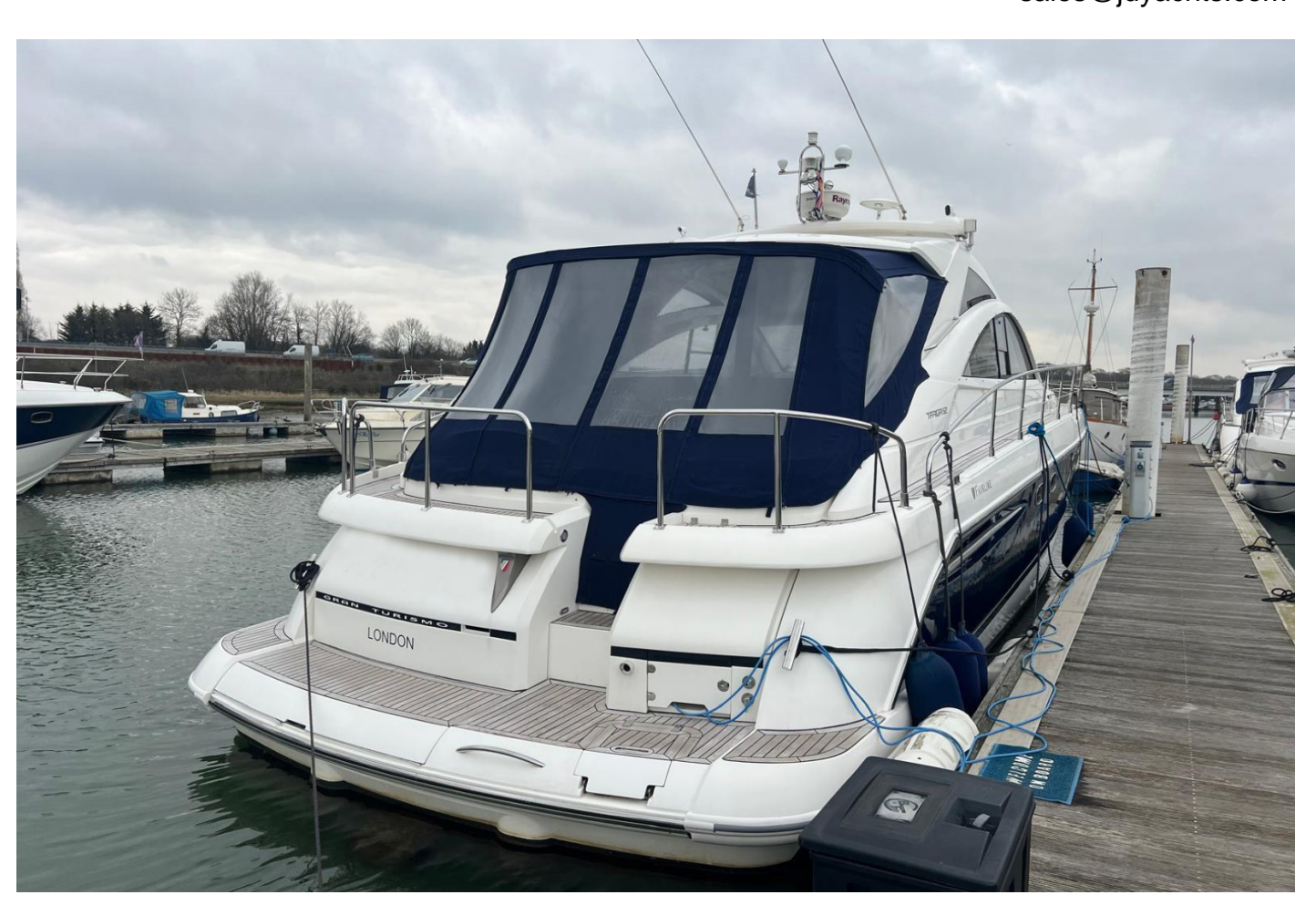
FAIRLINE TARGA 52 GRAN TURISMO

Tel: +44 (0)1305 766 504 sales@jdyachts.com