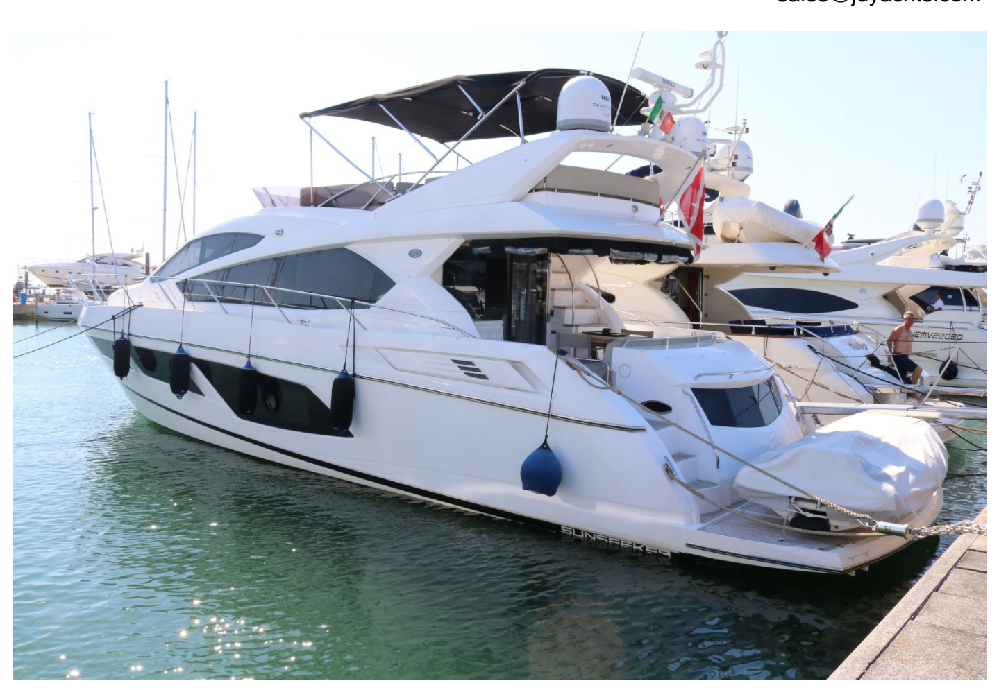
SUNSEEKER MANHATTAN 65

Tel: +44 (0)1305 766 504 sales@jdyachts.com