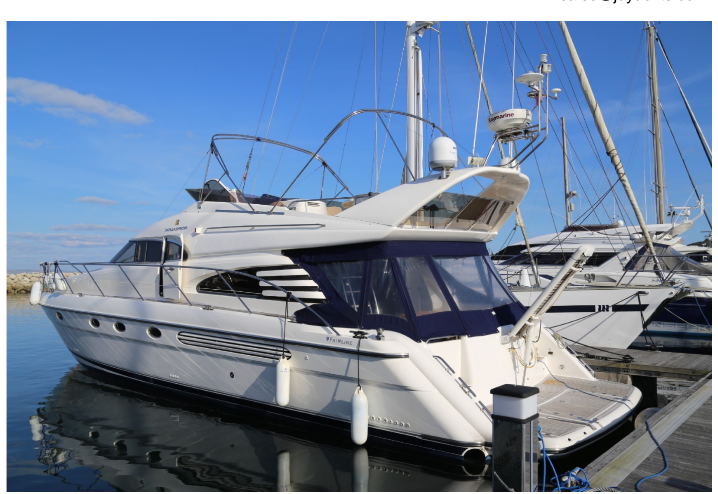
FAIRLINE SQUADRON 55

Tel: +44 (0)1305 766 504 sales@jdyachts.com