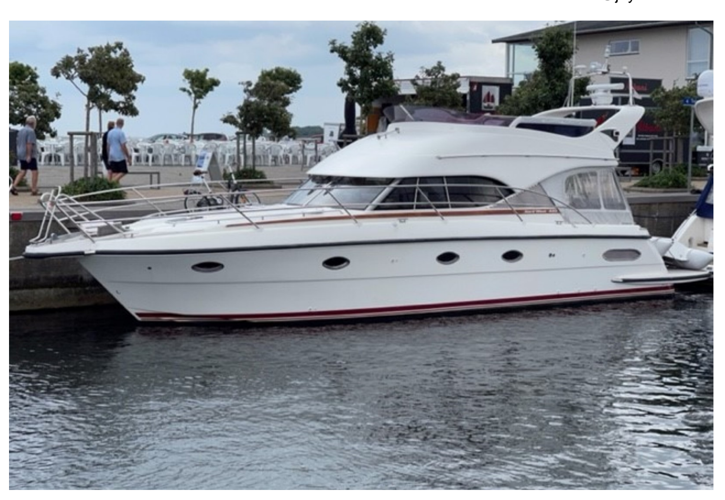
NORD WEST 420

JD Yachts 80 The Esplanade Weymouth Dorset United Kingdom DT4 7AA Tel: +44 (0)1305 766 504 sales@jdyachts.com